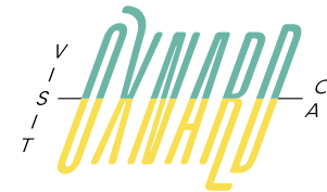
Don't arch or warp